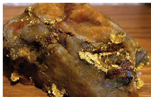
Spectacular gold in quartz specimen from Valentine Mountain's Discovery Zone