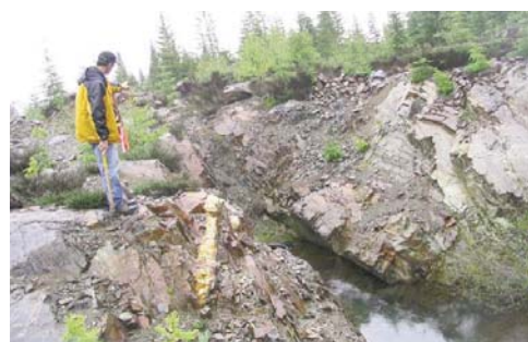
Valentine Mountain's discovery zone.

Results at Valentine Mountain have included a number of high-grade showings in trenching and diamond drilling.